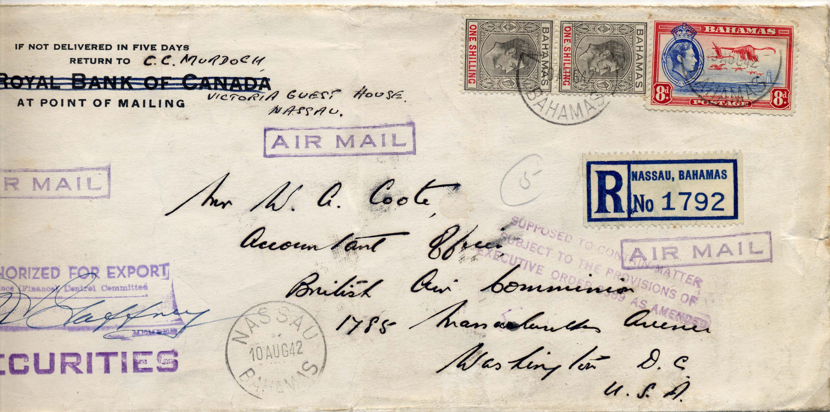
Pair of the 1/- 1941 striated paper printing

10th August 1942. Registered cover from Nassau to Washington DC. The 2/8 rate being the 4oz air mail rate plus the 5d airmail registration fee annotated in manuscript separately.