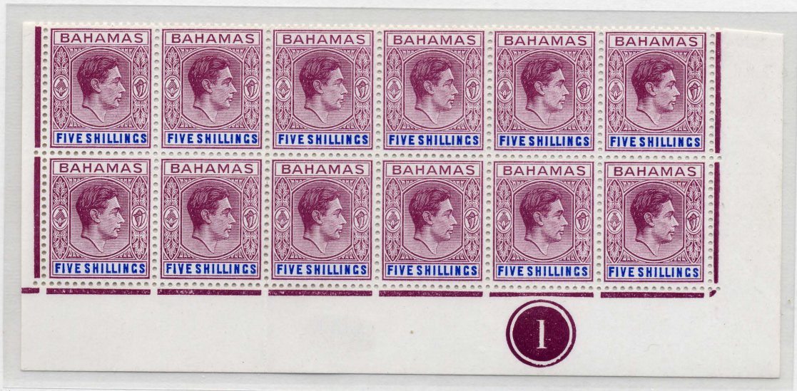
Head Plate 1 5/- printed February 1951

Two head plates were used throughout the printing of this issue. Head plate 1 was used from 1938 until February 1951, where up on it was scrapped and replaced by the head plate 2. This was only used from August 1951 until the last printing in December 1952.