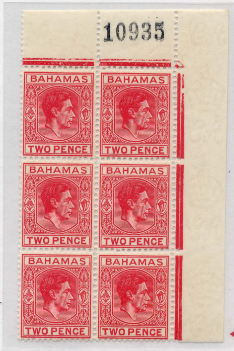
mature state, T short, stunted appearance