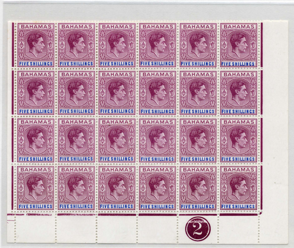
Head Plate 2 5/- printed September 1951