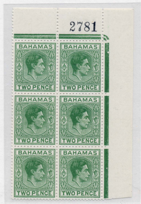
late state, T fish tailed appearance