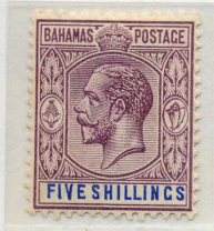
1935 George V 205 sheets printed