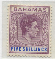
1938 1st GVI printing 410 sheets printed