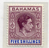
1948 printing 491 sheets printed