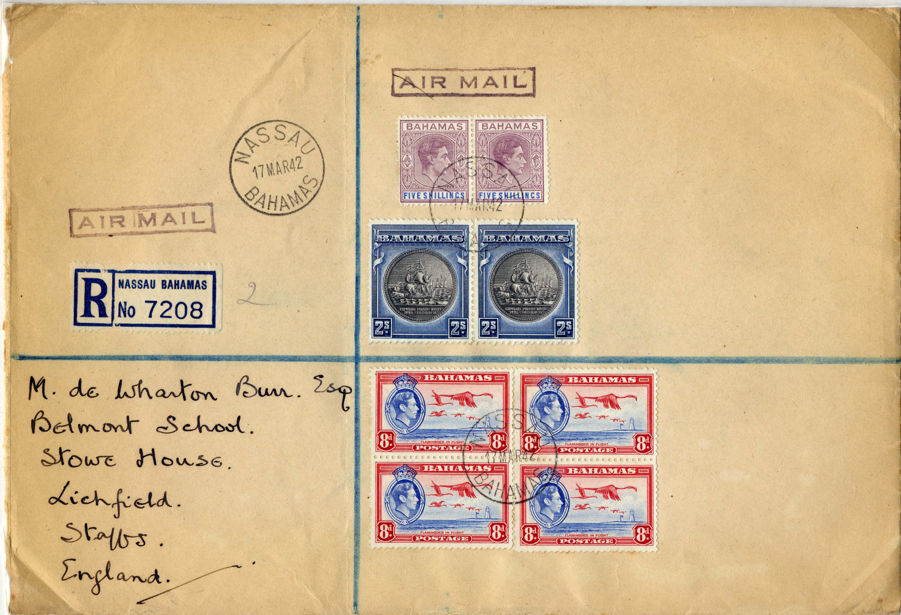
Pair of the 5/- 1941 striated paper printing

17th March 1942. Registered airmail packet from Nassau to Litchfield Staffordshire.