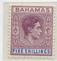
1941 2nd printing Striated paper two recorded