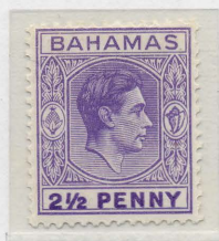
less than 10 known

The value tablet was printed twice, the first print being lighter in contrast, with the second print being just below and to the right of the original print.