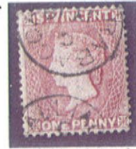
CALLIQUA plus RABACCA