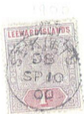
Kart de S.C.2