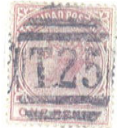
T25 not identified extremely rare