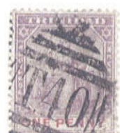
T40 not identified extremely rare