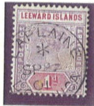
Laplace date in MS.