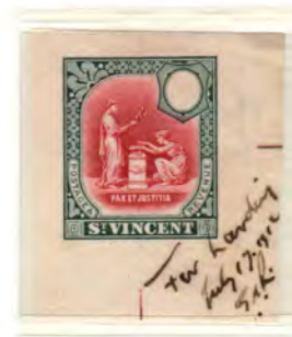
Master Die Proof on ordinary wove paper (30.5 x 35 mm) in Green and Dark Myrtle, the colours of the issued 5/- value. Marked in manuscript "For hardening July 17.1912" and initialled G.A.R. The design used for the high values 2/-, 5/- and £1.