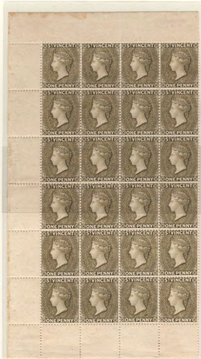
One printing of 60,000 copies in sheets of 60 (10x6) invoiced 3 October 1882. This block considered to be the largest known multiple of this issue. One Penny was the rate for postcards within the Windward Islands group and also as a makeup value.