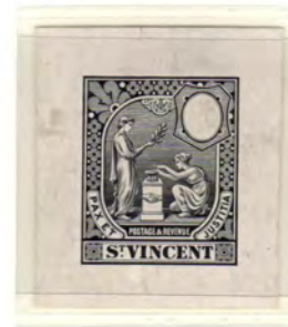
Probably produced in late January 1907. As used for the first Arms of the Colony series issued 1907 – 08. Inscribed "POSTAGE & REVENUE" below the vignette with the motto "PAX ET JUSTITIA" located in the tablets either side of the vignette and with a dot below the 'd' (pence indicator) when the value was printed in the value tablet.