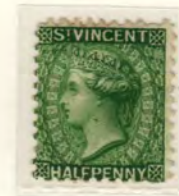
Flaw on Queens neck

One printing of 18,000 copies invoiced 8 June 1884. The Halfpenny value was used as a make up value.