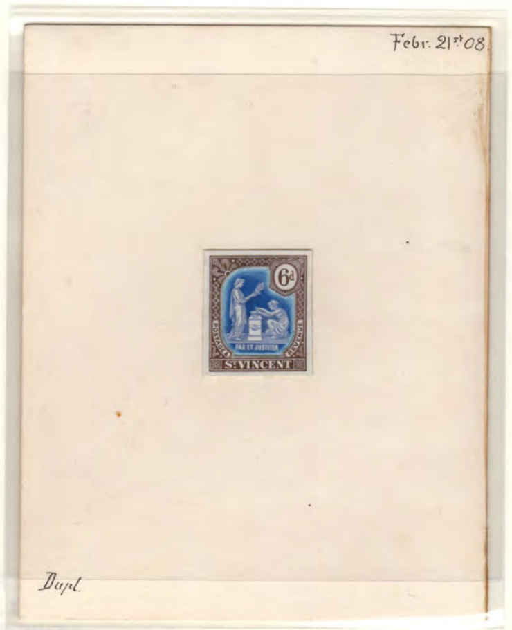
Composite stamp size essay, with Frame in Dull Blue and Vignette in Brown and marked 'Dupl' in lower left corner. Vignette and Frame printed and also touched up by hand.

Submitted to the Crown Agents following a request from Government House St. Vincent for specimens in new colours and relocation of the motto and the words "Postage & Revenue".