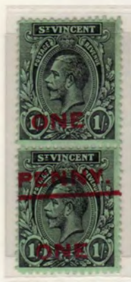
Misplaced Overprint 'ONE' misplaced towards bottom of upper unit and 'PENNY' and Bar appearing in upper part of lower unit. 'ONE' from the next overprint then appearing at the bottom of the second unit.