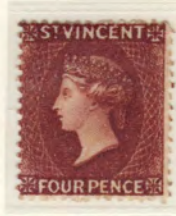
DEEP RED BROWN