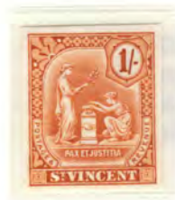
YELLOW - BROWN