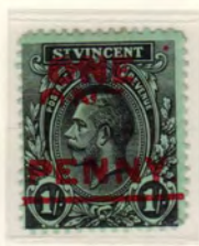
Error showing 'ONE' double.

ONE PENNY on 1/- BLACK on GREEN 30 JANUARY 1915