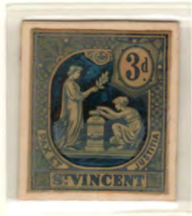
De la Rue Essay of receipt stamp size. With photographically reproduced centre and frame and hand painted background in Blue. An unacceptable design submitted 3 September 1906.