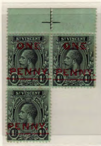
Error showing "ONE" omitted. It is thought that this error may have occurred on an experimental or trial printing.