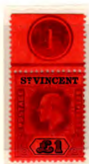
Plate No. 1 is the only Plate recorded as being used on this issue. Only 2 copies of Plate number recorded the other being on a Upper right marginal block of 4.