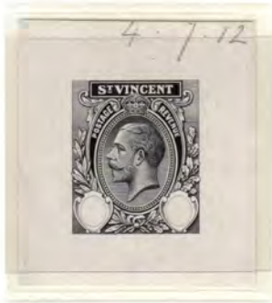
Master Die Proof in Black on glazed paper (36 x 38 mm) dated 4.7.12 in pencil. Government House St. Vincent had approved this design (for the eight low values of the series (½d to 1/-) by letter to the Crown Agents 13 March 1912.