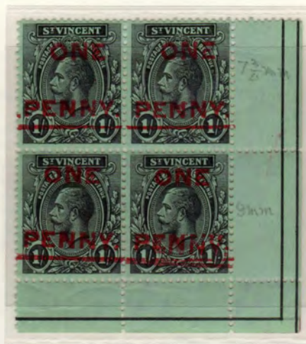
R2/2 showing the error 'PENNY and bar double' R1/1 with 'full stop before and after 'PENNY'.