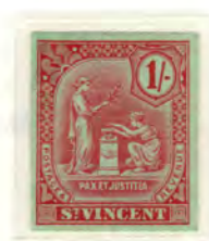
RED on GREEN