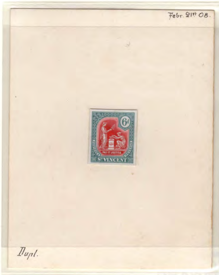
Composite stamp size essay, with Frame in Dull Blue-Green and Vignette in Red and marked 'Dupl' in lower left corner. Vignette and Frame printed and also touched up by hand