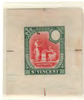
Probably produced July 1912, on ordinary wove paper (35 x 41 mm) In Green and Myrtle, similar to the colours of the issued 5/- value and also showing four centring guidelines