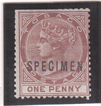
ex Urwick ex Beach

The rare 1879 £1 with the Samuel type D8 handstamp