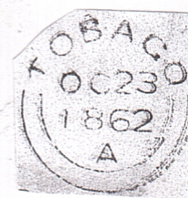
Single rate to Sun Fire Insurance Co. cancelled with the earlier type with a double-ring circle.