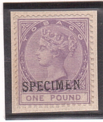
Ex de la Rue archives

The UPU did not begin to circulate stamps with specimen defacements to its members until 1884. However, a few other specimens were prepared by de la Rue for internal purposes. Apart from the £1, those below are thought to be unique. Each has the CC watermark.