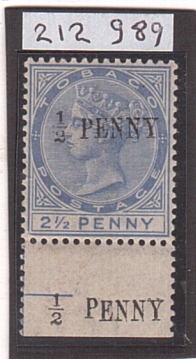
From a sheet with one row showing double overprint.