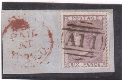
Crowned circle unusually applied to a stamped cover.

The rare single ring circle used from 1875 to 1878