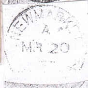
Pre-UPU 4d interisland rate to Jamaica.