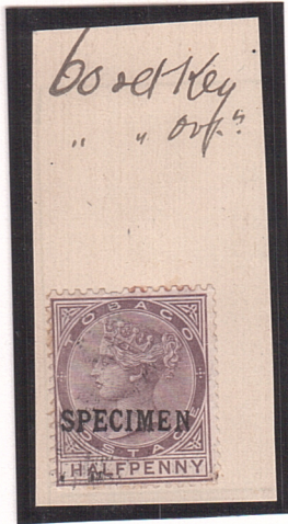
Piece of de la Rue records indicating that the stamps were to printed in panes of 60