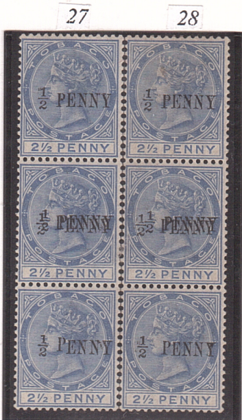
Wide and narrow space on same stamp