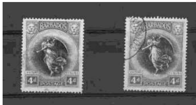
Figure 5: in this image the right-hand stamp has a Hootstein forged postmark. The postmark on the left one is probably genuine.