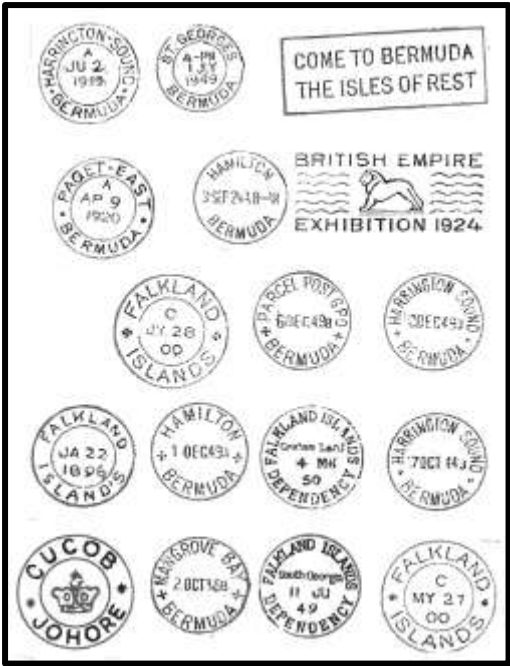
Figure 1 (at 50%): the card sent to printers