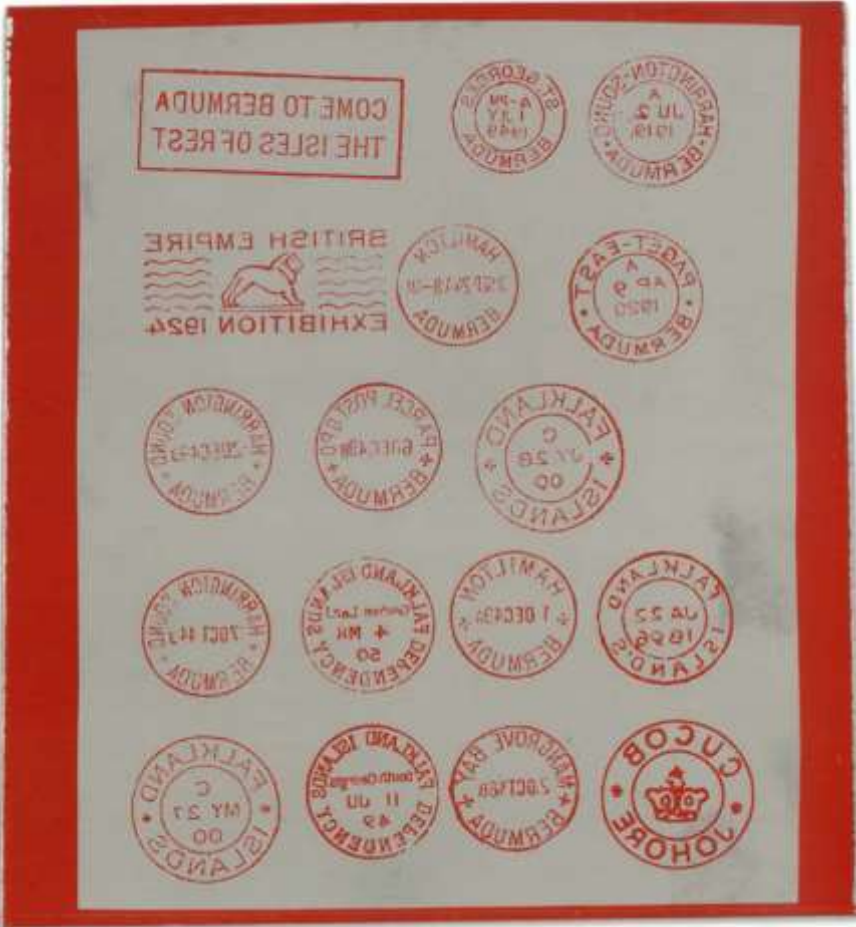
Figure 3 (at 66%): negative transferred to the zinc plate in reverse