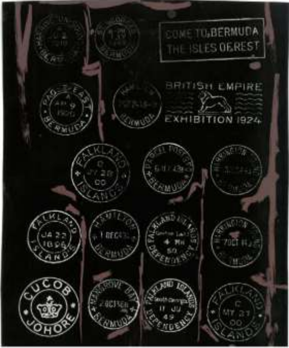
Figure 2 (at 50%): first stage – a photo negative