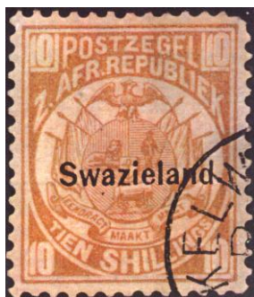
Fig 27 – Stop disguised, at 175%.

Scarcity of copies of the genuine issued 10/- has resulted in fraudulent attempts to alter the ‘with stop’ 10/- duty to resemble the 10/- stamp as originally issued. The collector is advised to be alert to the existence of 10/- stamps where the stop has been expertly removed from an unused copy or a used copy, both are known, and to used 10/- stamps where a carefully positioned strike or carefully positioned smudge of the squared circle postmark has obliterated the stop or has covered the evidence of prior removal of the stop. Examples of both are known on this and the other duties.