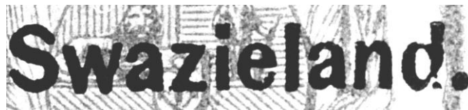
Fig 26 – Characteristic example of the ‘with stop’ overprint on the 10/-, with example selected to show large level circular stop, at 600%.

One pane (60 stamps) of the 10/- received this overprint.