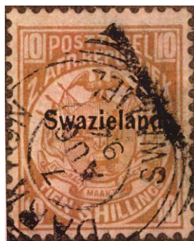
Fig 28 – Stop obliterated, at 175%.