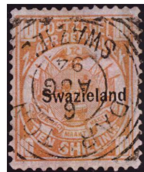
Fig 29 – Stop removed, at 175%.