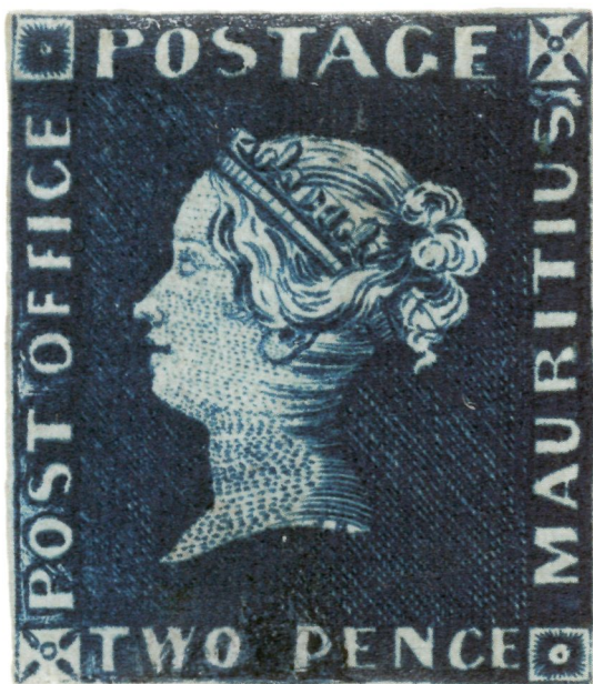
Mauritius: 1847 2d deep blue, unused.

Of Channel Islands, Second World War German occupation issues (mainly Guernsey) was given in 1948 by G L Walker. Apart from a range of covers there are many sheets.