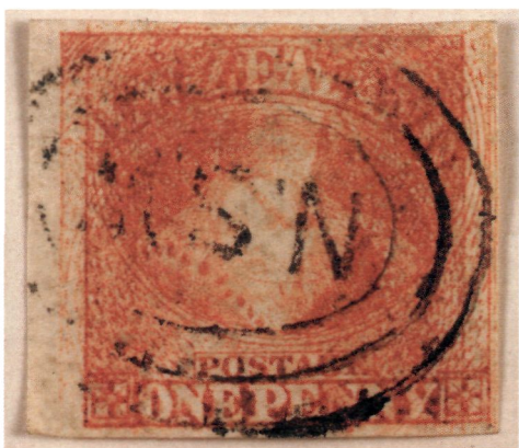
New Zealand: 1857 1d dull orange, "Dwarf", used.