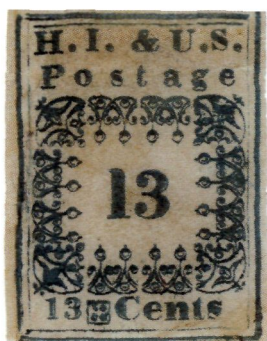
Hawaii: 1851-52 HI and US Postage 13 cents blue, type 1, unused.