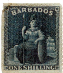
Barbados: 1861-70 1/- blue, error of colour, unused.

The British Library is the national library of the United Kingdom. It was created in its present form from a number of existing bodies in 1973 following the previous year's Act of Parliament. The Library maintains a comprehensive collection of manuscripts and printed material providing a national centre for reference, study, bibliographical and other information services for the sciences and humanities, as well as document supply service for remote users.