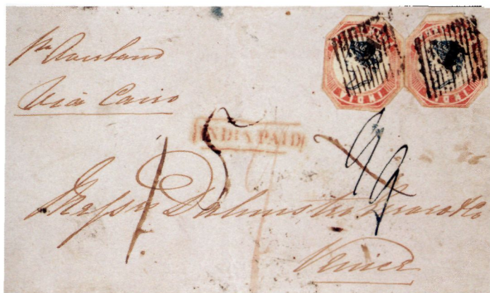
India: 1854 4 annas blue and pale red, two copies used on cover.