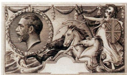
Great Britain: 1913 Seahorse Master Die Proof in sepia.