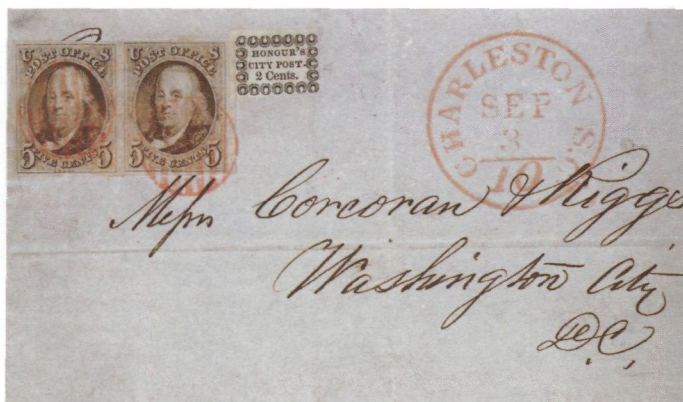
United States: Carriers' Stamps, Honour's City Post 1849 2 cents black on entire with General Issue 1847 5 cents a horizontal pair