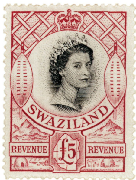
Swaziland: Revenue 1956 £5 black and red, unused.