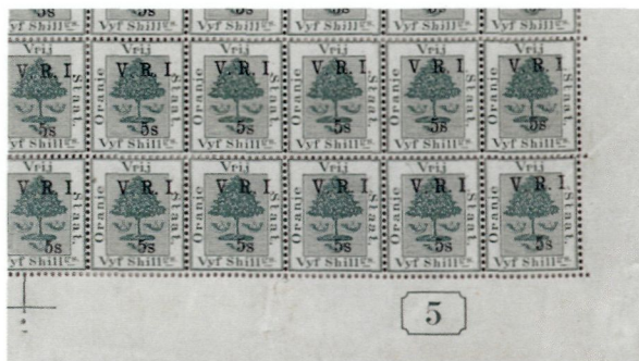
Orange Free State: 1900 5/- green, a sheet.

An extensive display of material from the collections is on exhibition and is probably the best permanent display of diverse classic stamps and philatelic material in the world. Approximately 80,000 items on 6,000 sheets may be viewed; about 2,400 sheets are from the Tapling Collection. The exhibition galleries are open: 09.30 to 18.00 Monday, Wednesday, Thursday and Friday; Tuesday 09.30 to 20.00 (late opening) Saturdays 09.30 to 17.00 and Sundays 11.00 to 17.00. Please make enquiries for further details.