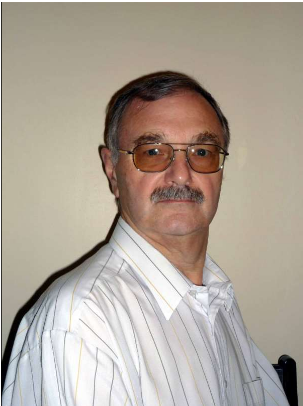
The Author September 2013 The moustache disappeared at the time of my daughter's wedding. She thought it "made me look too old"