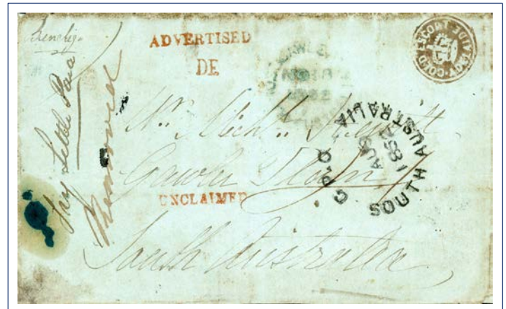
A 'Gold Escort' cover of 1852.