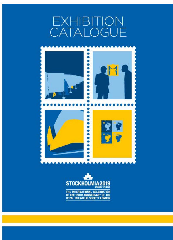
Front cover of the STOCKHOLMIA 2019 Exhibition Catalogue

The second volume will be the Library Catalogue. Its contents will include reviews of all RPSL publications and the Crawford Medal winning titles from the Tomas Bjäringer library as well as all the competitive literature entries in the exhibition.