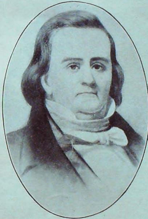
CHARLES A. WICKLIFFE OF KENTUCKY ELEVENTH POSTMASTER GENERAL UNDER THE CONSTITUTION OCTOBER 13, 1841—MARCH 6, 1845

PUBLISHED BY THE POST OFFICE DEPARTMENT WASHINGTON, D. C.