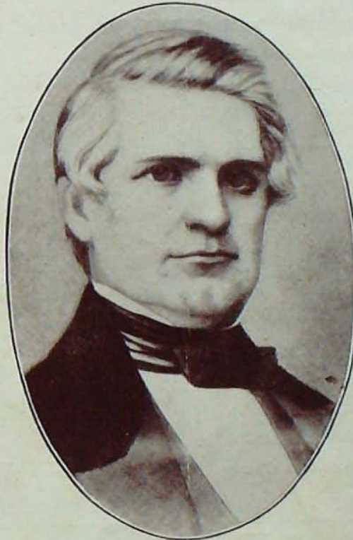
NATHAN K. HALL OF NEW YORK

FOURTEENTH POSTMASTER GENERAL UNDER THE CONSTITUTION JULY 23, 1850-SEPTEMBER 13, 1852