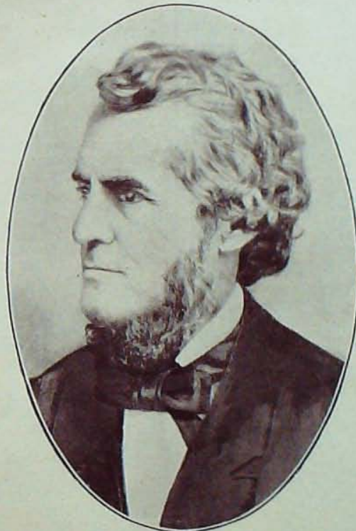
WILLIAM DENNISON OF OHIO

TWENTY-FIRST POSTMASTER GENERAL UNDER THE CONSTITUTION OCTOBER 1, 1864 - JULY 24, 1866