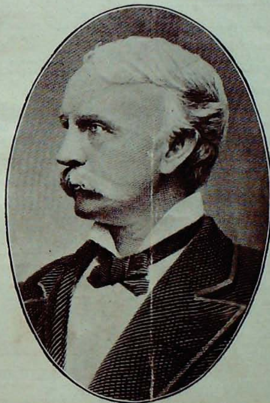
JAMES N. TYNER OF INDIANA

TWENTY-SIXTH POSTMASTER GENERAL UNDER THE CONSTITUTION JULY 13, 1876 - MARCH 12, 1877