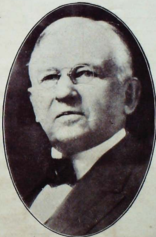
JOHN WANAMAKER OF PENNSYLVANIA

THIRTY-FIFTH POSTMASTER GENERAL UNDER THE CONSTITUTION MARCH 6, 1889 - MARCH 6, 1893