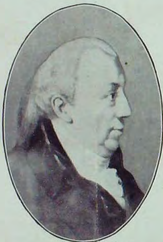
GIDEON GRANGER OF CONNECTICUT* FOURTH POSTMASTER GENERAL UNDER THE CONSTITUTION NOVEMBER 28, 1801 - APRIL 10, 1814

PUBLISHED BY THE POST OFFICE DEPARTMENT WASHINGTON, D. C.